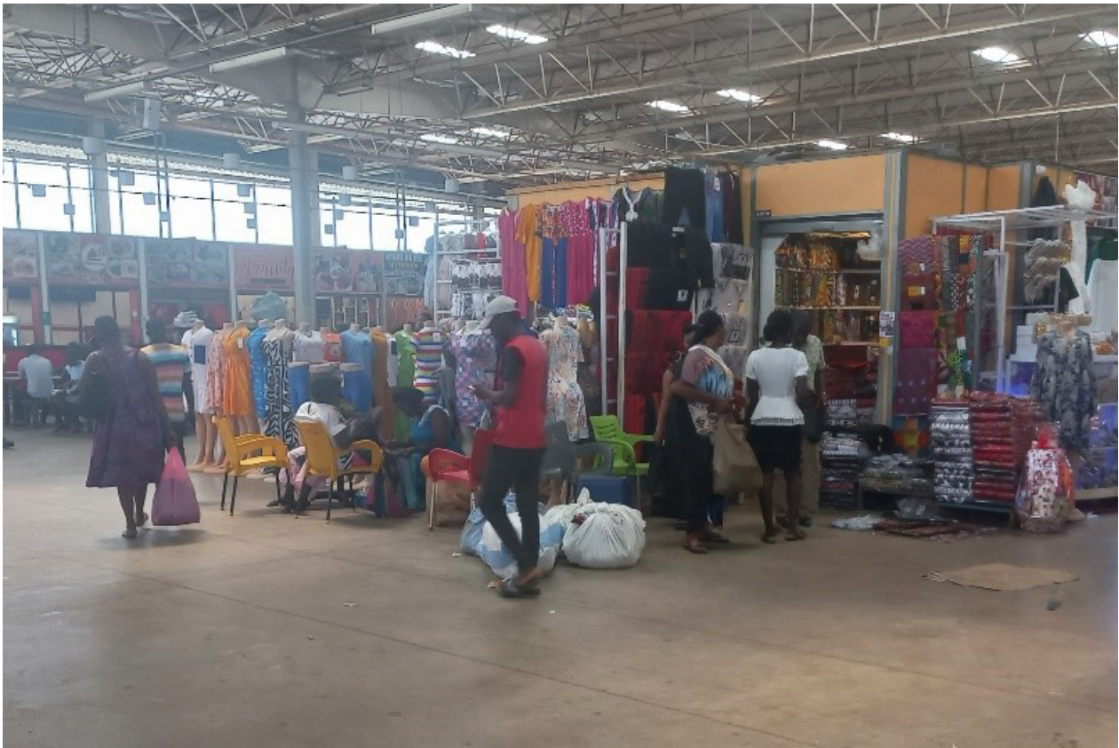
Fig. 5: Food and clothing sections in the Kejetia Market in Kumasi

While global measures of infection control are effective and applicable in many places, it is important for countries to select measures that fit their context. Instead of closing down market facilities or running a shift system to enforce social distancing in a marketplace where several informal workers are dependent on a daily wage for survival, market authorities should exert their energy towards providing hygienic conditions in the marketplace through improved sanitation and regular fumigation. Indeed, a handwashing protocol and regular fumigation are relatively easier to implement than social distancing protocols. These measures are less destructive to businesses and the economic life of the market players, especially the vulnerable groups. What is needed is the commitment of stakeholders to make resources available to sustain the supply of hygiene consumables.