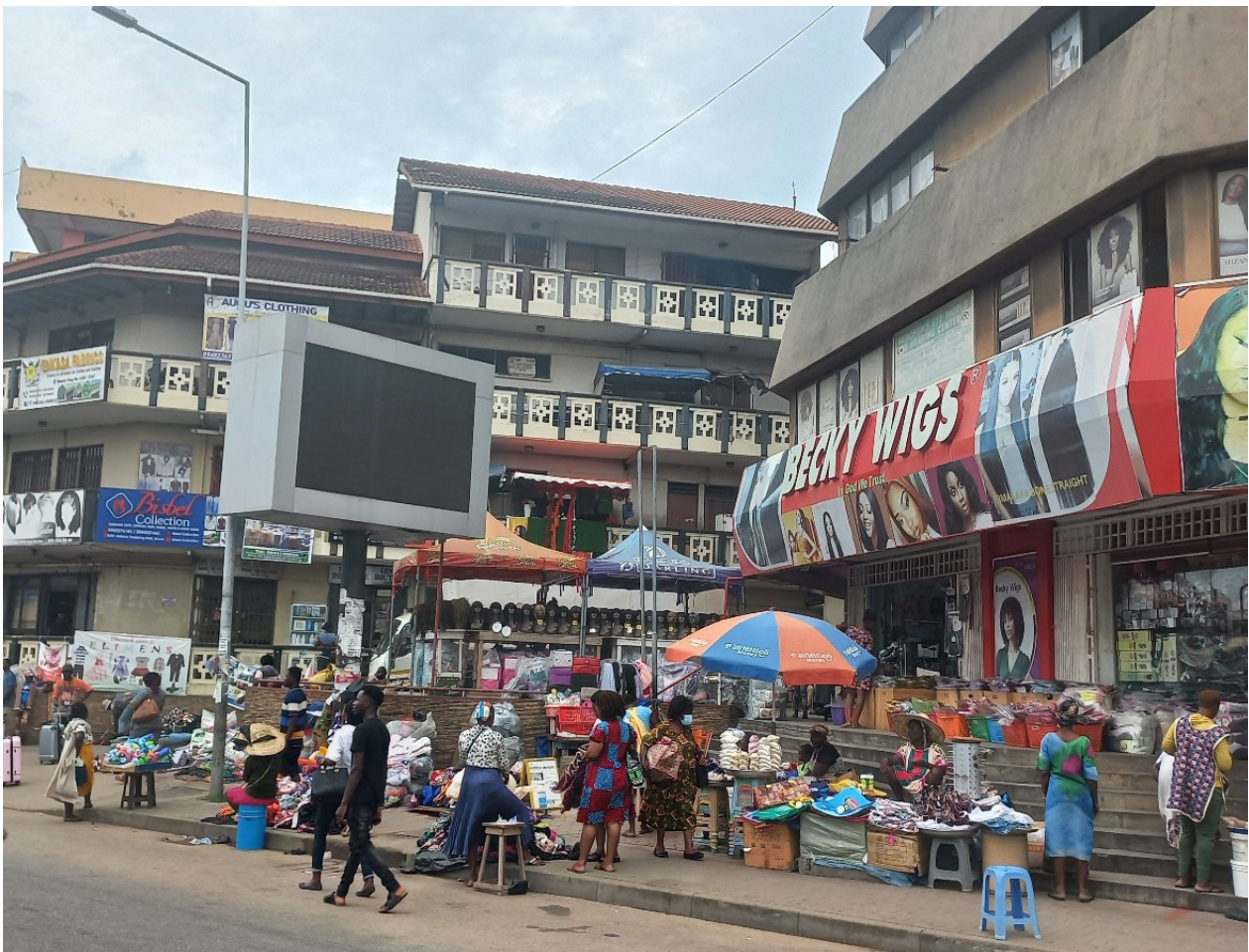
Fig. 2: Frontage of the Makola Shopping Mall.

In this Policy Brief we present selected findings of direct relevance for policy intervention in marketplaces. The first part details some of the challenges regarding the actual implementation of infection-control interventions that we found at the three case-study markets in Kumasi and Accra. A better understanding of the actual barriers can inform the formulation of future measures. The second part points out three recommendations to improve future pandemic resilience in the marketplace.