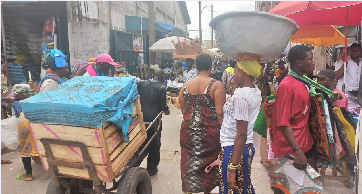
Fig. 6: Truck pusher delivering tomatoes in the 31st December Market

to strengthen good governance for the benefit of market workers and the society at large. While the research was conducted in Ghana, it has implications for the governance of infection control measures in marketplaces in other West African countries.