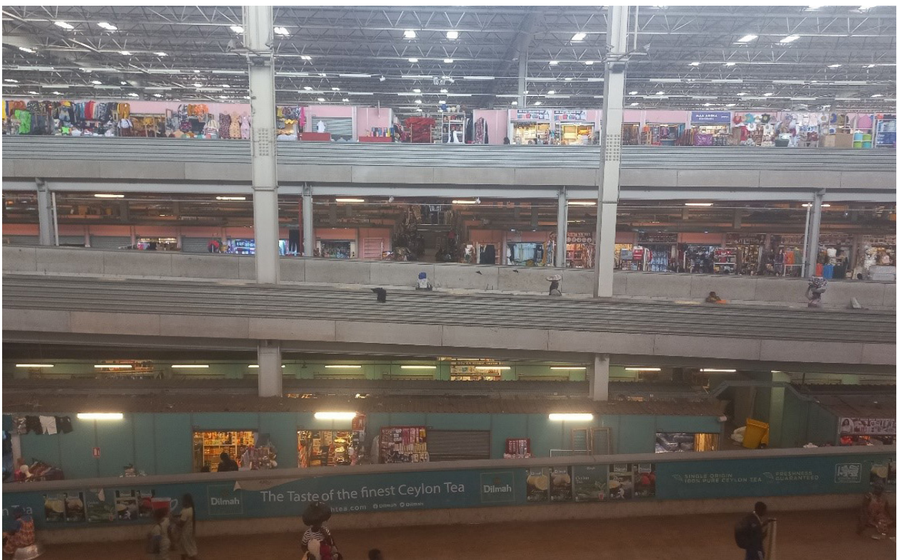
Fig. 4: The multi-storey Kejetia Market in the centre of Kumasi

all applications submitted, particularly by micro and small businesses, are processed and funds are disbursed to them accordingly. Industries in Ghana, many of which supply products for sale in the marketplace, could do more through their corporate social responsibility either by supplying goods to traders at a reduced price or by supporting (loyal) traders with relief funds during pandemics. Trader associations could also support their members through their welfare schemes.