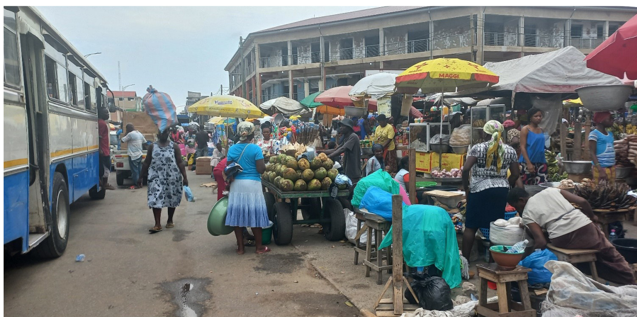
Fig. 3: Brisk trading activities at the 31st December Market

Hand hygiene – through regular handwashing and/or with the use of hand sanitizer – is one of the most effective protocols of limiting the transmission of COVID-19 and other infectious diseases. As hand hygiene became critical in the wake of the COVID-19 pandemic, market authorities in Accra and Kumasi improvised handwashing facilities with Veronica buckets – filled with water – together with liquid soaps and hand sanitizers. This sanitary equipment was mostly donated by individuals, traditional authorities and corporate institutions. When these donations ran out, there were no dedicated funds to re-supply sanitary equipment for use in the marketplaces. There was also no arrangement with market traders to provide sanitary equipment for general use in the market. Shop assistants, head-porters and truck pushers were not obliged to regularly fill Veronica buckets with water. Consequently, the handwashing protocol was, in most cases, relaxed after a few weeks of implementation in marketplaces in Accra and Kumasi.